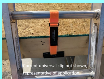
Current universal clip not shown, representative of application

Available through registered Direct Metals Inc distributors. Made in the U.S.A. Patent Pending