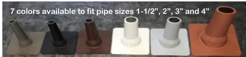
7 colors available to fit pipe sizes 1-1/2", 2", 3" and 4"