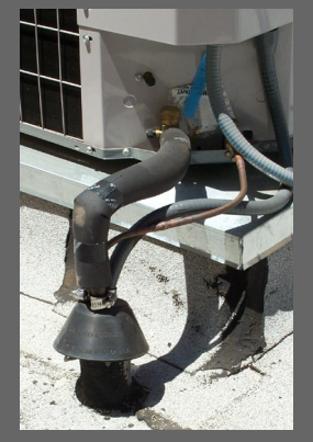
Patented "Watertight Umbrellas" U.S. Patent # 5067291